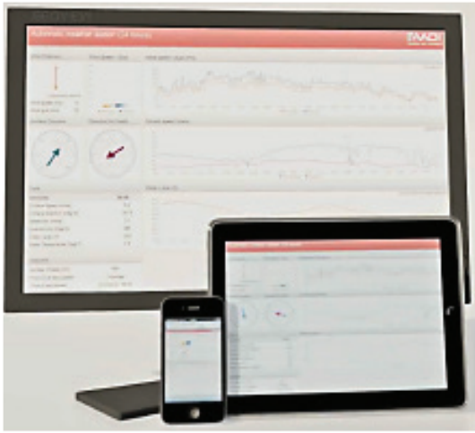
Figure 2: Compatible with iPhone and iPad