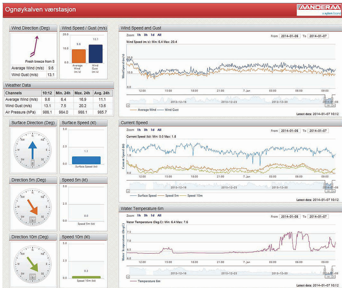
Figure 1: Aanderaa GeoView program

GeoView is part of the Aanderaa Real-Time Solution. This gives the user vast opportunities for interfacing meteorological, oceanographic or other environmental research equipment in a networked solution giving access to data real-time.